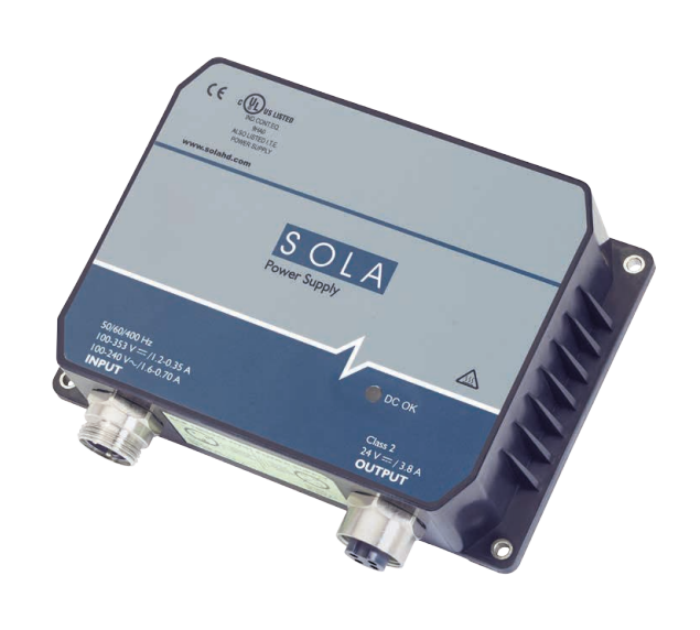
IP67 SCP-X SELF-SEALED POWER SUPPLY 5.4" x 7" x 1.8"