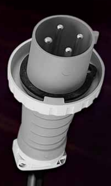
IEC 309 PIN AND SLEEVE